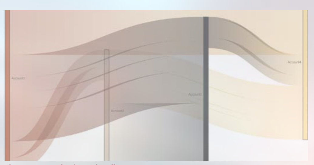
Figure 1 - example of a Sankey diagram

a steam engine, Sankey diagrams are a type of flow diagram in which the strength of linkage between two entities is depicted by the thickness of the interconnecting line. In their twenty-first century form, these charts are interactive such that the connections can be explored and the source and destination of assets can be tracked and demonstrated through multiple intermediate stages.